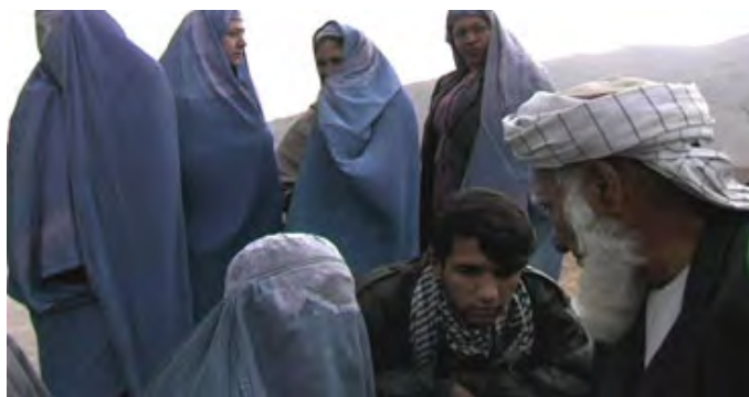
Scene from Kabul Transit