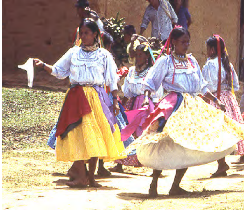
Lamas Indian women dancing during the Fiesta de Santa Rosa, 1977. Lamas, Dept. of San Martín, Peru.