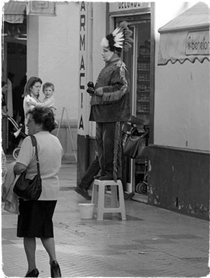
Mime dressed as American Indian Ronda, Andalusia, Spain April 2001