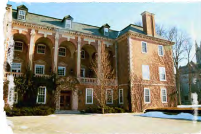
Stetson Hall at mid-winter

Welcome to the Spring 2001 issue of ANSO News , the online newsletter of the Department of Anthropology & Sociology at Williams.